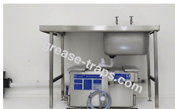
Position GRU Auto In Location