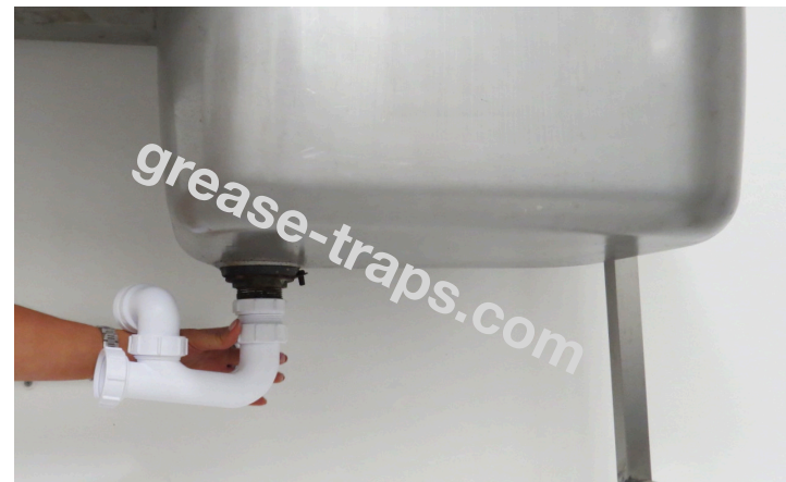
Replace With Low Level Trap (McAlpine SM10)