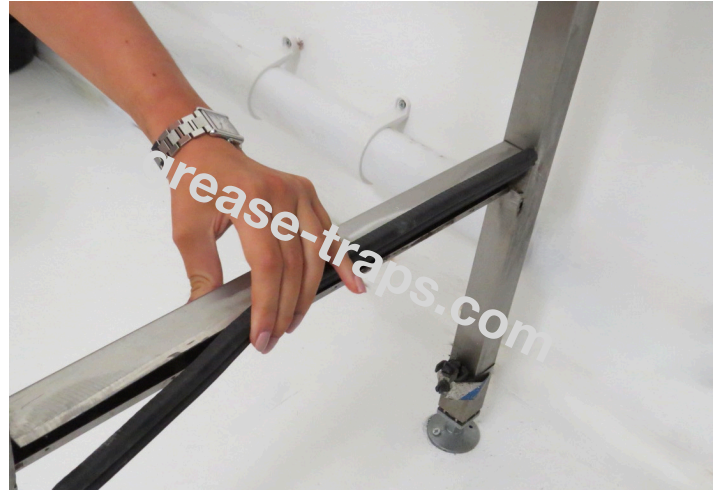
Apply Edges With Edging Seal Or File Smooth