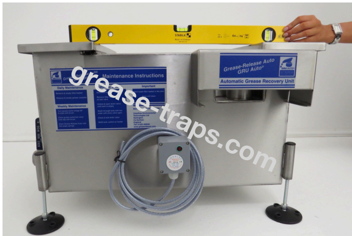
Adjust Feet Until Tank Is Level