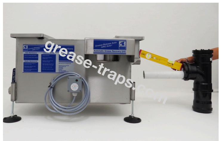
Ensure Fall From Tank To Main Drain