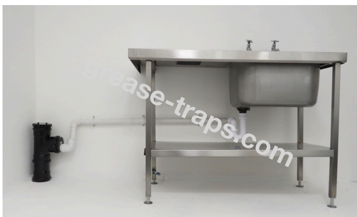
Choose & Clear Area To Fit The GRU Auto