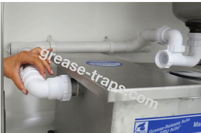
Connect Compression Fittings To Tank