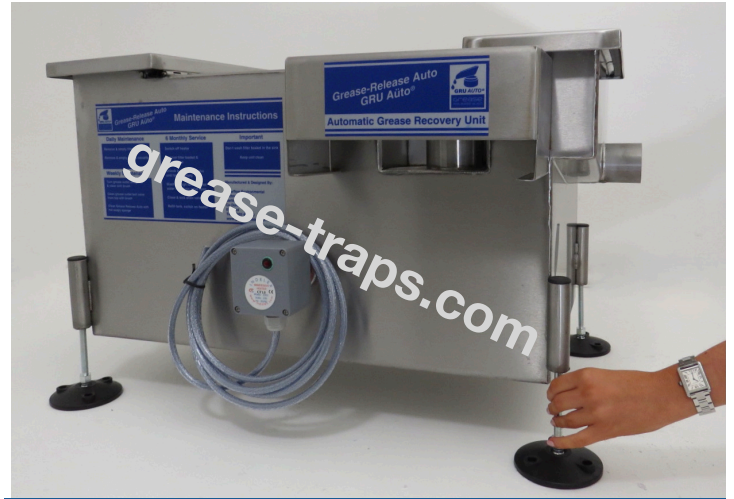
Screw in 100mm Levelling Feet