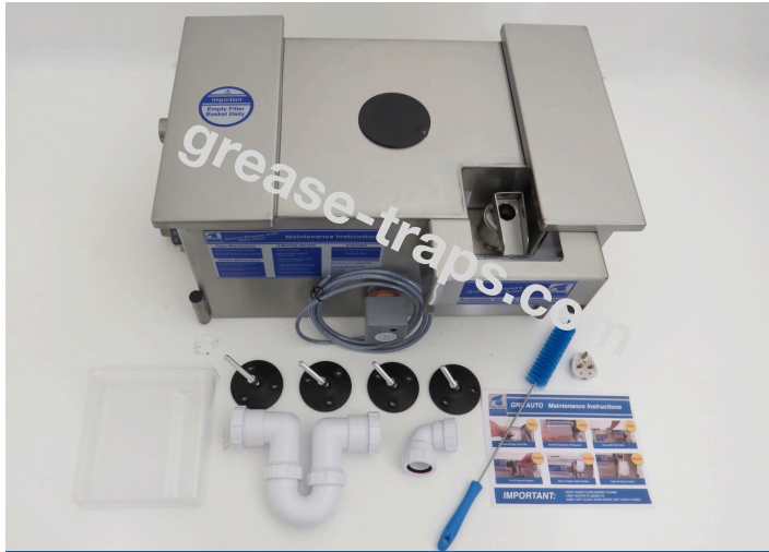
Un-Pack GRU Auto Contents