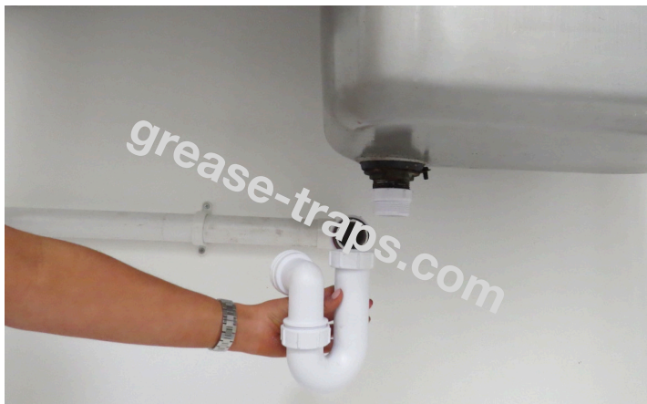
Unscrew & Remove P Trap From Sink