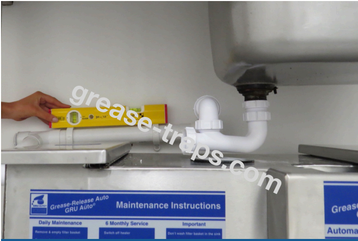
Plumb Pipe From Sinks, Ensuring Gravity Fall