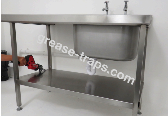
Cut Out Shelf With Replicator, Leaving Edges