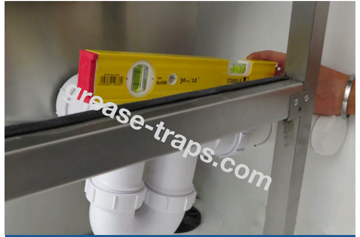
Plumb Outlet, Ensuring Gravity Fall On Trap