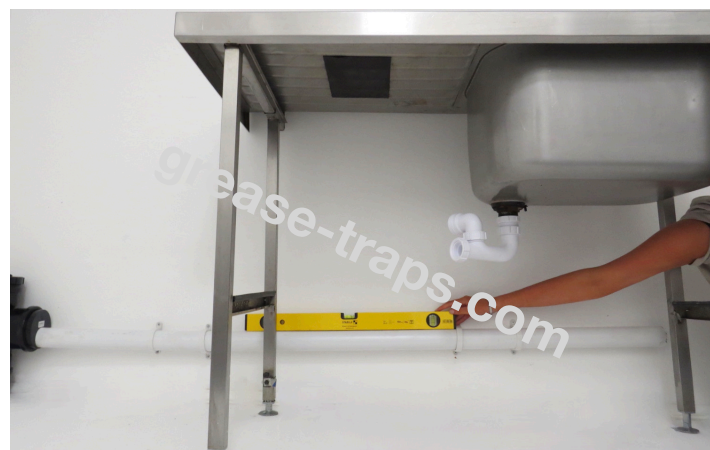
Fit 2" Outlet Pipe From Main Drain