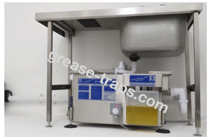
Fill Tank With Water & Switch On Heater